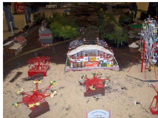
Part of Circus Area