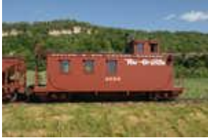
Rio Grande 0503 side view