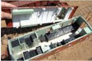
Rio Grande 0503 Interior 2