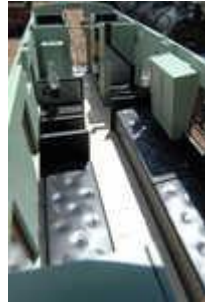
Rio Grande 0503 Interior 3