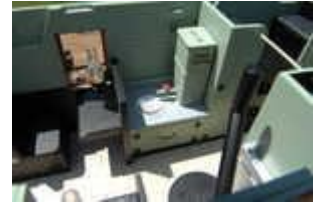
Rio Grande 0503 Interior 4