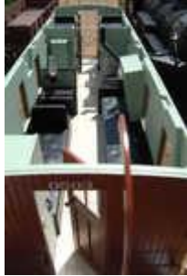
Rio Grande 0503 Interior 1